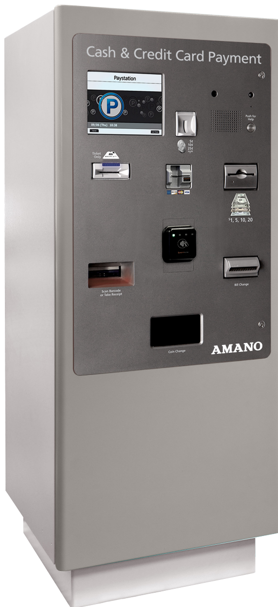
Shown with optional EMV Terminal.

The Pro+ 7800 Series Central Pay-on-Foot Station communicates with Pro+ and is designed for flexibility and ease-of-use in any facility. The fully functional, touch screen-controlled device utilizes the latest architecture to deliver accelerated system processes and transaction speeds, making it the perfect solution for 24/7 unattended operations. The Central Pay-on-Foot Station processes encrypted 2D data matrix barcode tickets from Pro+ 2000/2700 Series Entry Terminals. Payment options include credit card, bills, coins, and validations. Mobile and printed barcode validations can also be processed through the optional FlexScan QR400® barcode scanner.