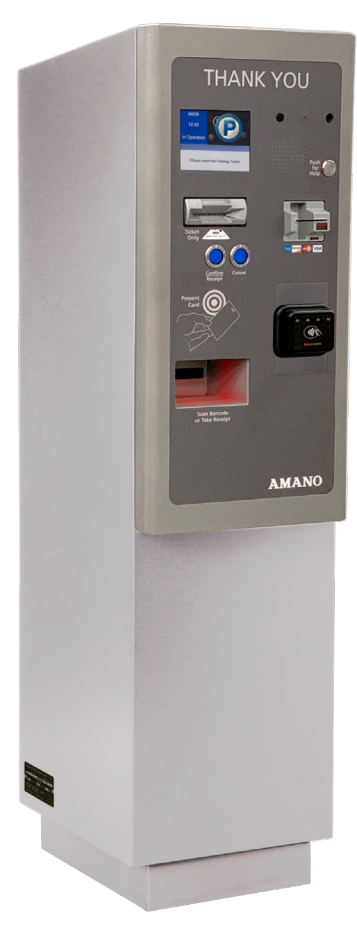
Shown with optional EMV Terminal.