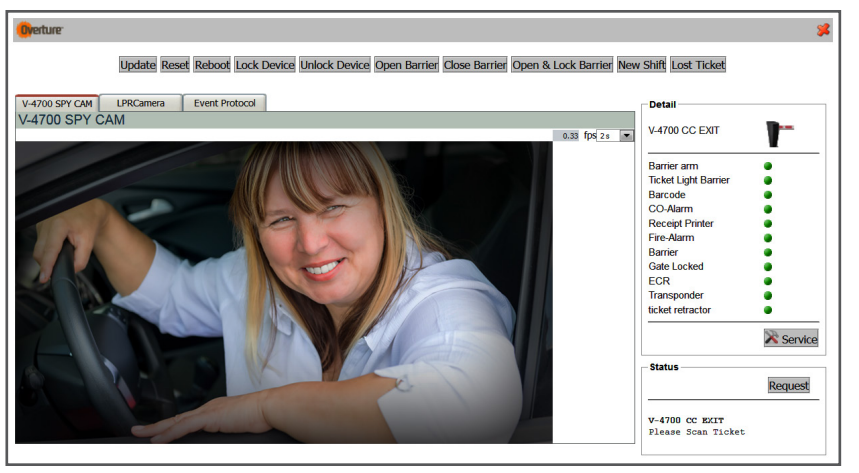
Patron requesting assistance viewed in camera